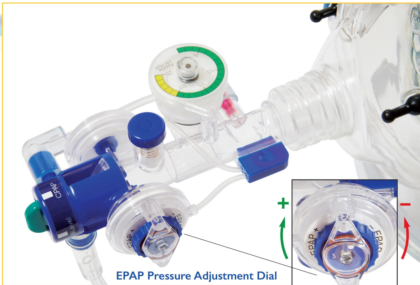
EPAP Pressure Adjustment Dial