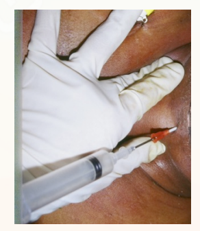
Quick Fix, Jr. (Pediatric Needle Cric)