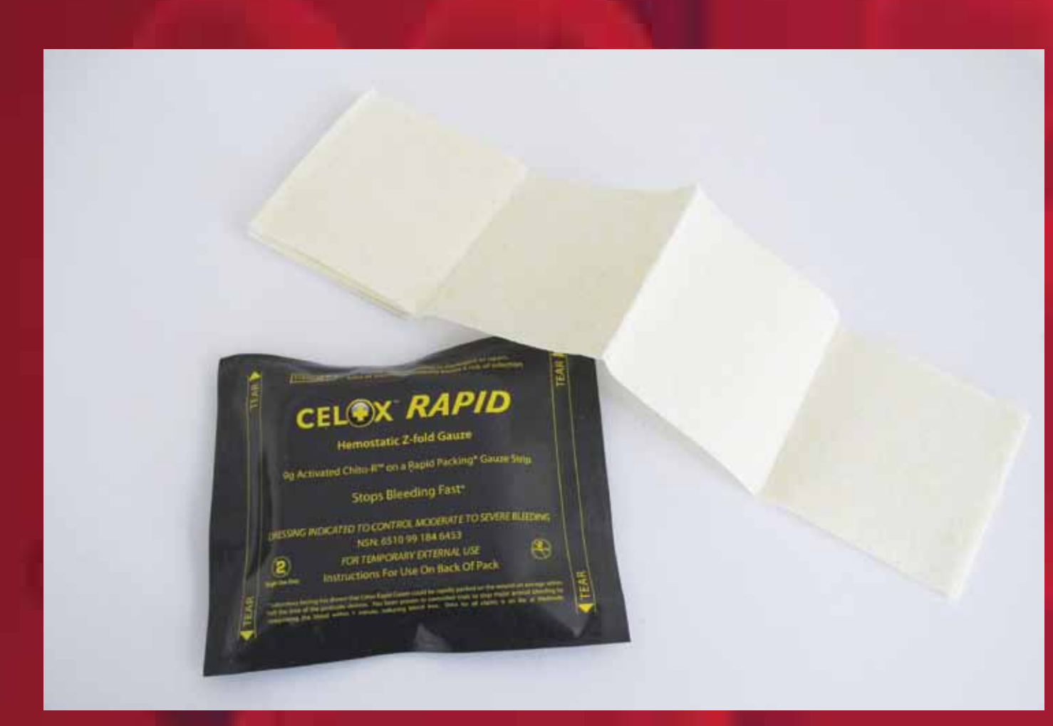
Figure 1 – New hemostatic dressing

The objective of this study is to assess the efficacy of this new rapid haemostatic gauze without applying any compression and after a short (one minute) compression time using a model of severe arterial hemorrhage.