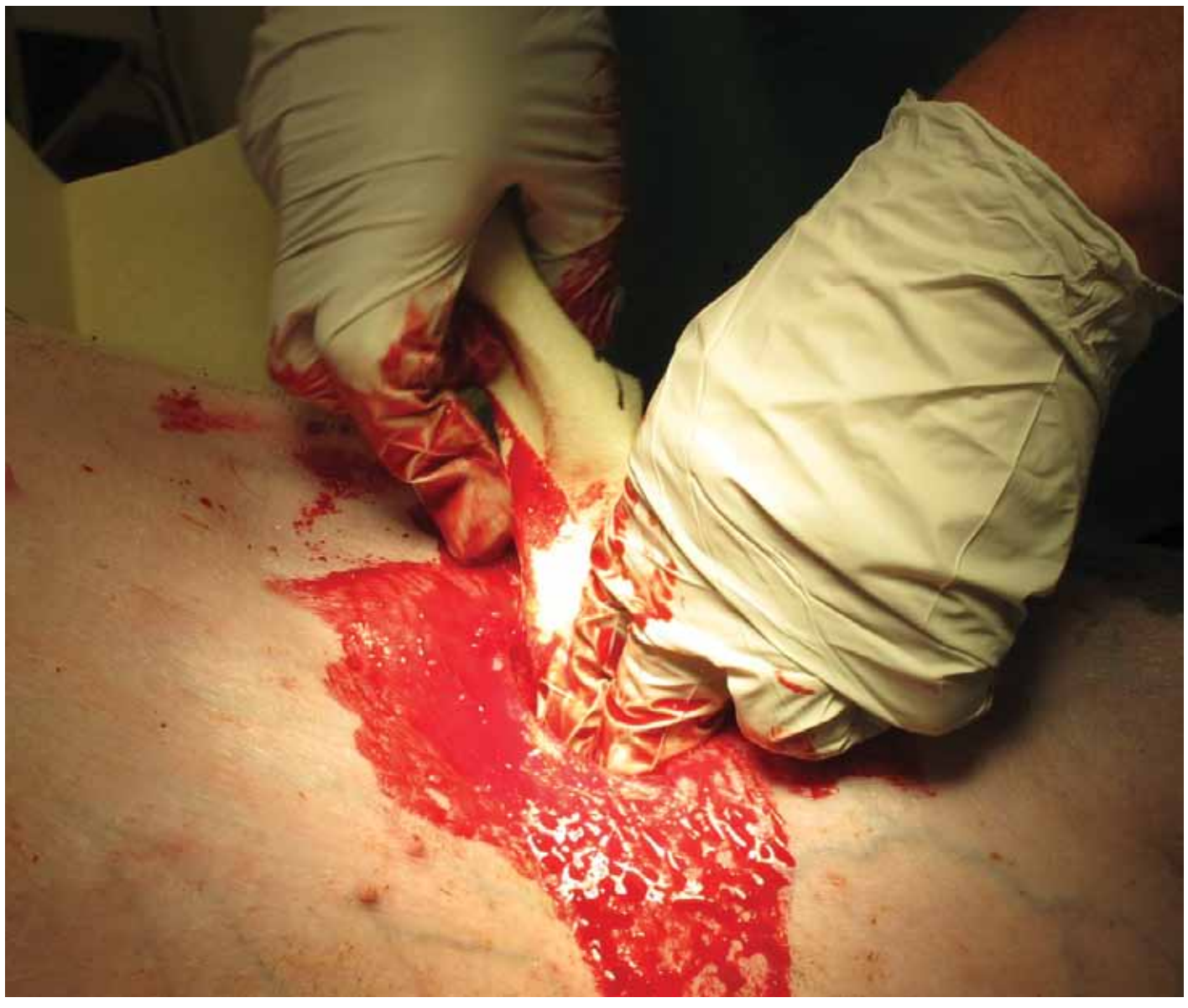
Figure 2 – packing.

Additional tests were carried out on Celox Rapid at three minutes' compression (current TCCC guideline) to provide a baseline.