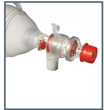
Disposable PEEP Valve 20