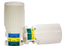
3-SET O2-CPAP Valve