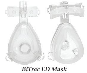
BiTrac ED Mask