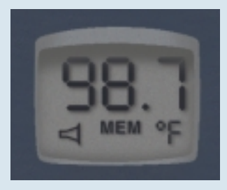
Easy-to-read, LCD displays temperatures in either Fahrenheit or Celsius.

Three year limited warranty offers peace of mind for many years of use