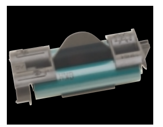
Can be used with a rechargeable battery pack (as shown)