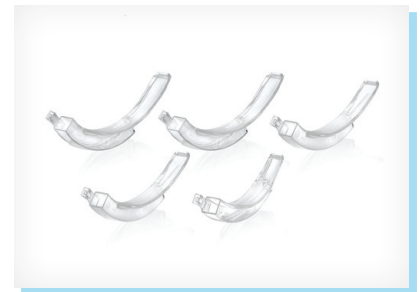
Size 1, 2, 3, 4, and 5 disposable Mac blades are available for the ClearVue™ VL3D.