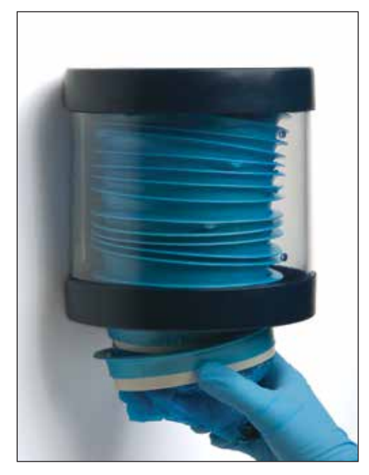
Convenient dispenser available