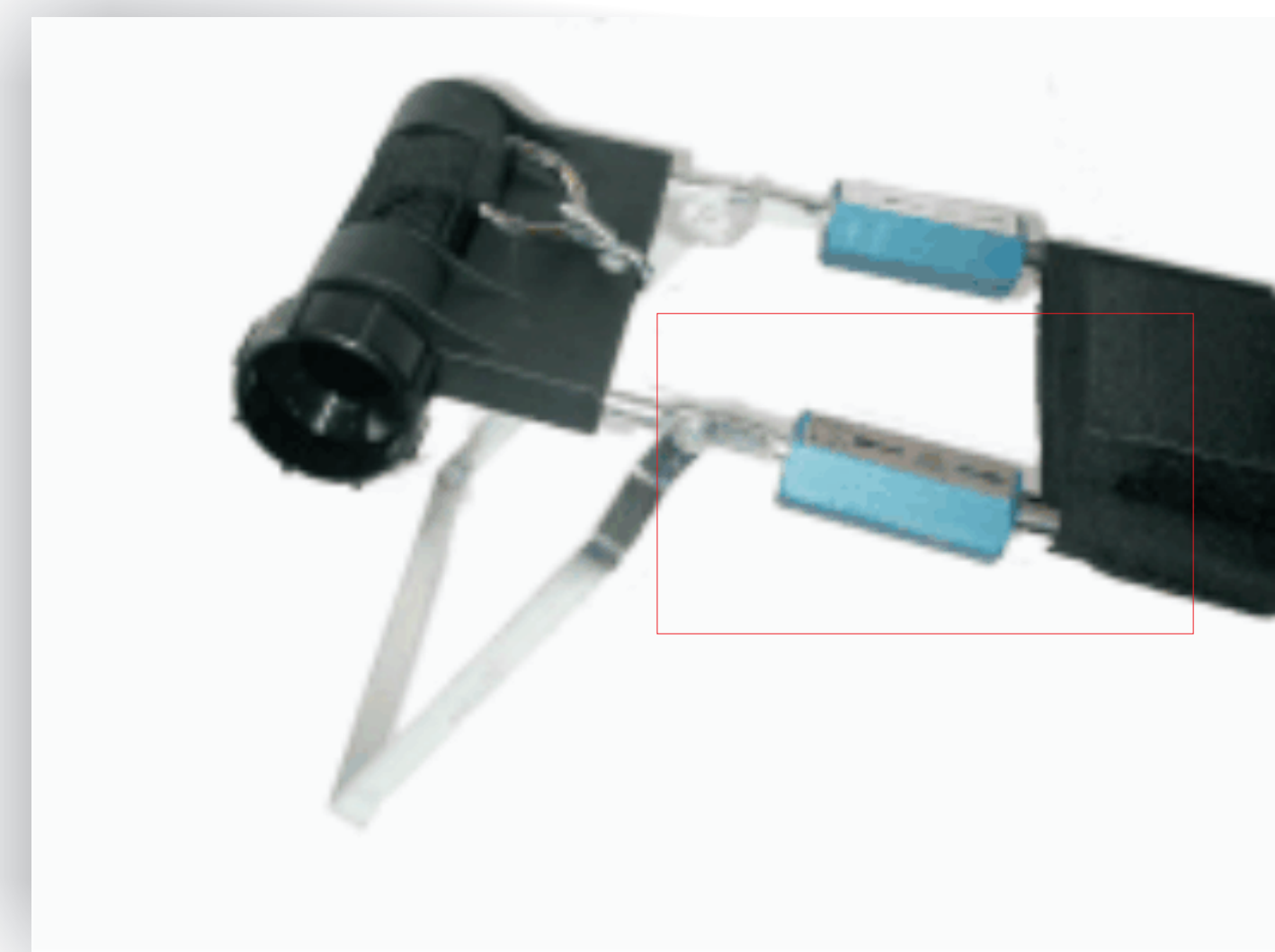
Injection Molded Ratchet