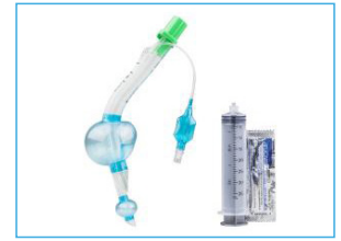
King LTS-D Kit Pediatric