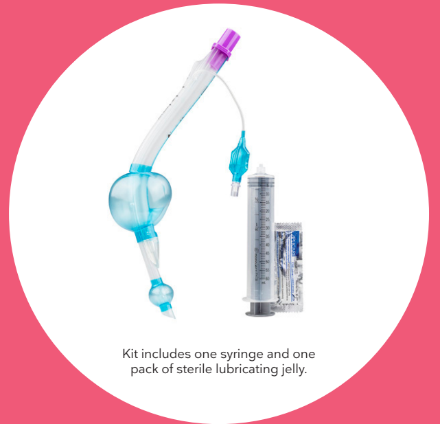
Kit includes one syringe and one pack of sterile lubricating jelly.

A single port inflates both proximal and distal cuffs. The proximal cuff stabilizes the King LTS-D and seals the oropharynx. The distal cuff blocks entry of the esophagus, reducing the possibility of gastric insufflation. The King LTS-D achieves ventilatory seal pressures of 30cm H 2 O or more. Multiple distal ventilatory openings and bilateral ventilation eyelets facilitate air flow.