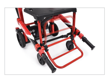
Extending footrest provides added support and comfort for patients.