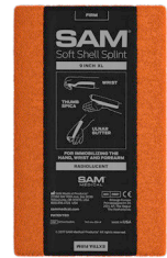
XL 5.5 in wide