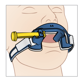
I. Larger opening The Thomas Select Tube Holder is similar in shape to the Thomas Tube Holder, but has a larger opening to accommodate the wide range of airway tubes on the market. Includes position indicator symbol for correct placement.