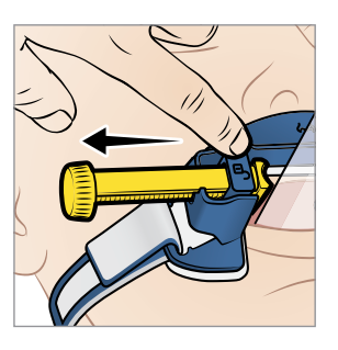
4. Quick Release For a quick release of the tube clamp, simply push the unlock button.