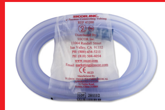
#43200 - 6 Feet