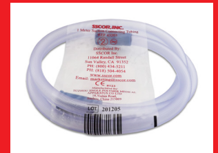
#43203 - 3 Feet